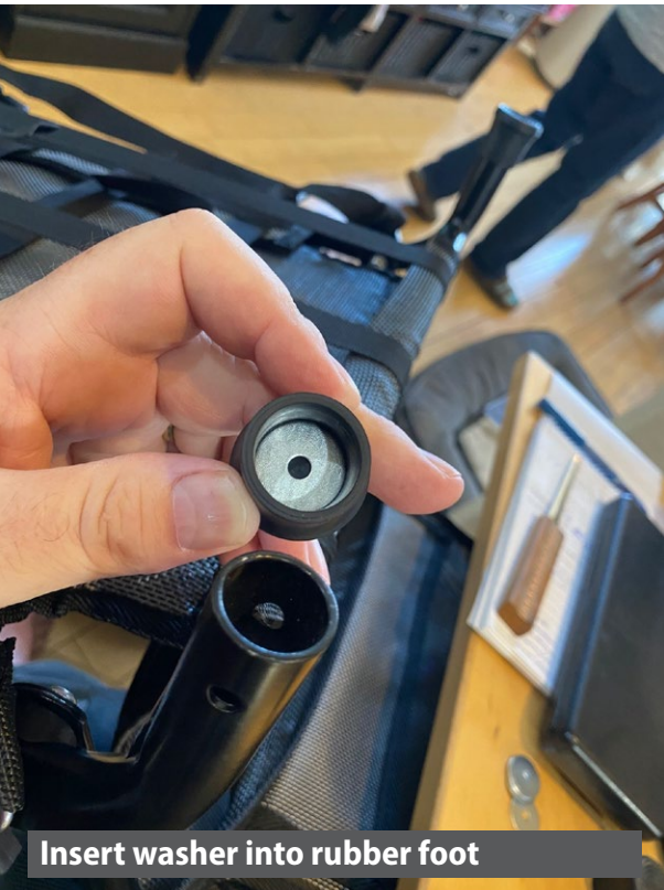
Insert washer into rubber foot