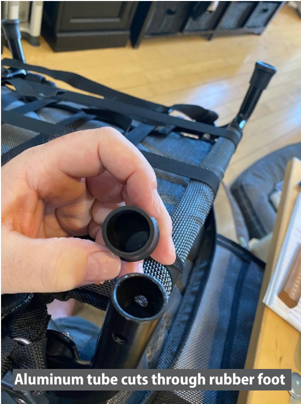
Aluminum tube cuts through rubber foot