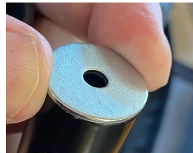
Fender Washer - 22mm OD Imperial DIMS: (7/32" ID - 7/8" OD)